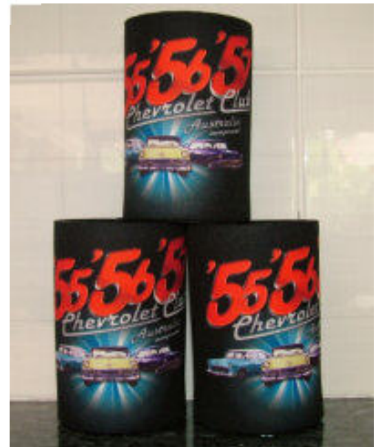
Stubby Holder $5.00