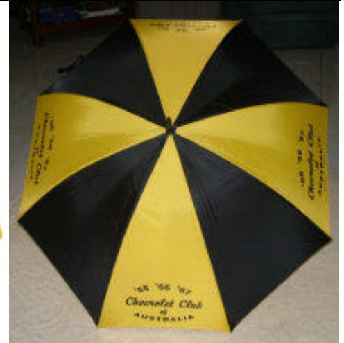
Club Umbrella $30.00