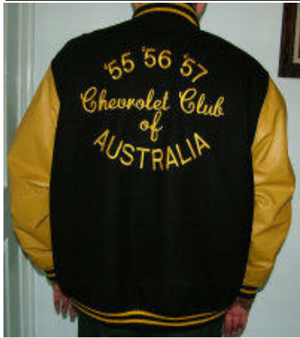
Club Jacket (order only, Dep. Required) $250