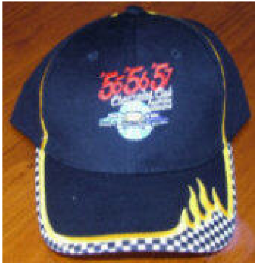
Club Cap $15.00