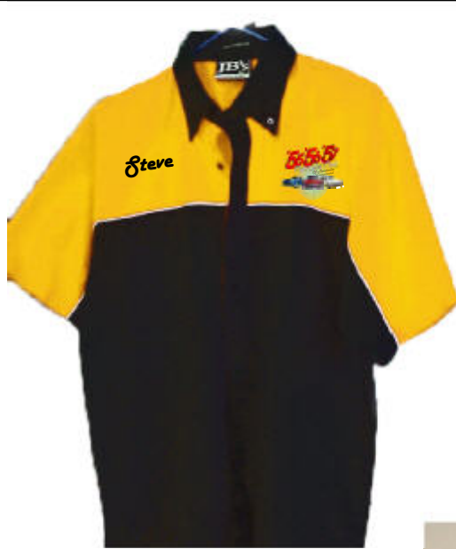
Bowling style shirts Mens Shirt $35.00 Embroidery of name $5.00